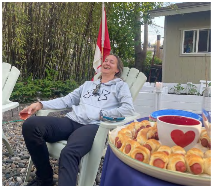
Sitting around a fire pit with "typical" campfire food.