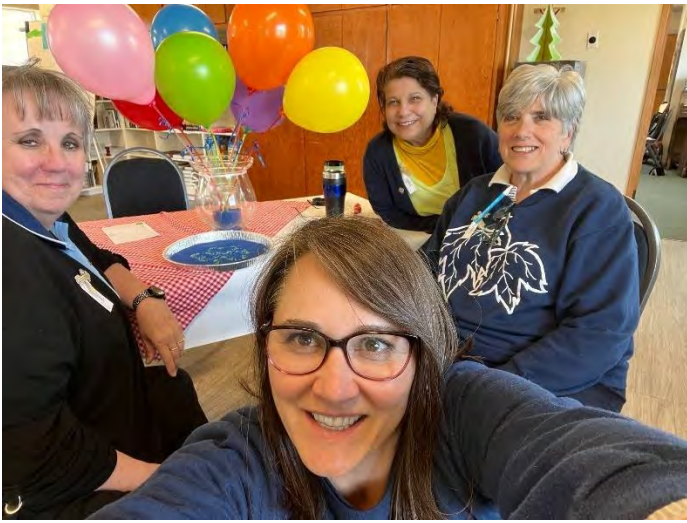
The Scavenger Hunt