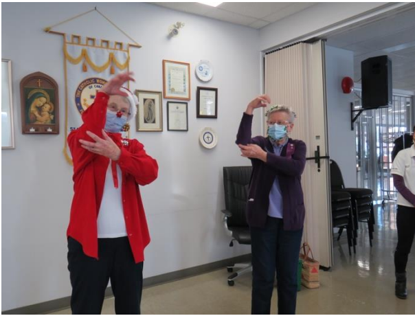
A Partridge in a Pear Tree