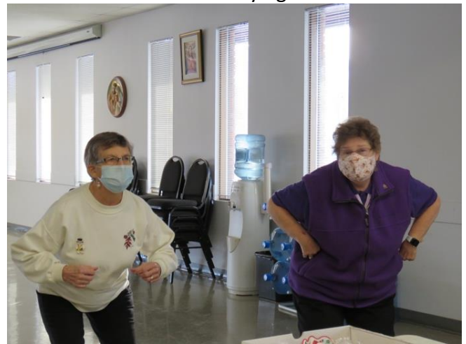
Six Geese a-laying