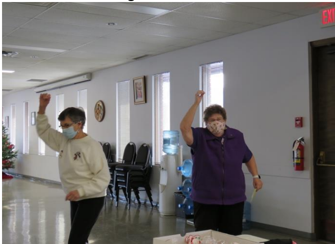
Nine Ladies Dancing