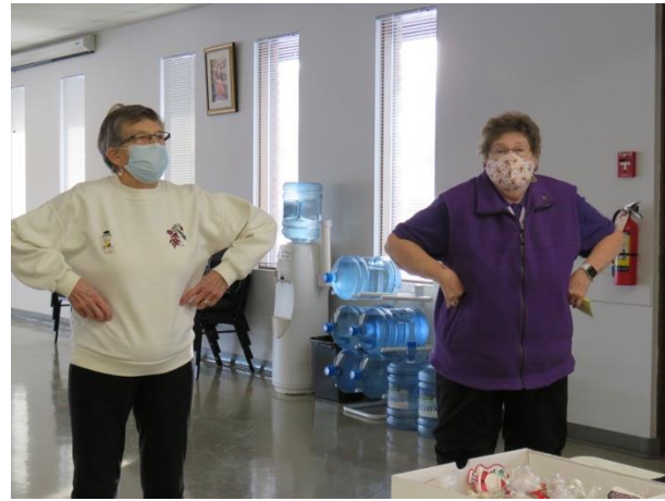
Three French Hens