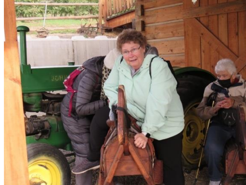
but success was achieved