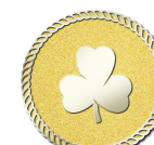
Gold (11+ years)