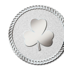
Silver (4-10) years