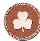
Bronze (1-3 years)

The Unit Guider Award is presented to Unit Guiders in recognition of good service in the Unit Guider role. Nominators must provide a completed R.3 form, along with two letters of support. The award is granted by the council concerned. The years of experience are cumulative and a Unit Guider may receive any or all of the award levels during her tenure in Guiding. The bronze can be received by a Unit Guider in her first year. The award is given in three levels: